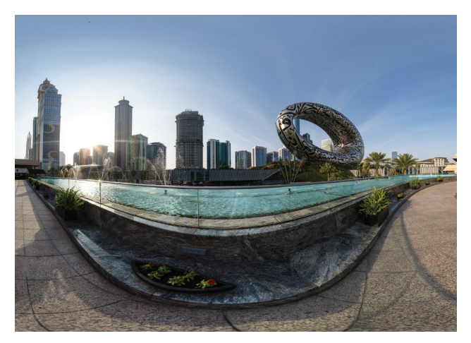
Panaromic view - Museum of Future, Dubai