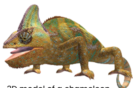
3D model of a chameleon